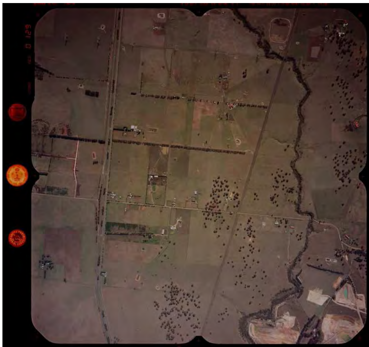
Aerial photograph dated 2 May 1998, showing southern portion of PSP Area 25.