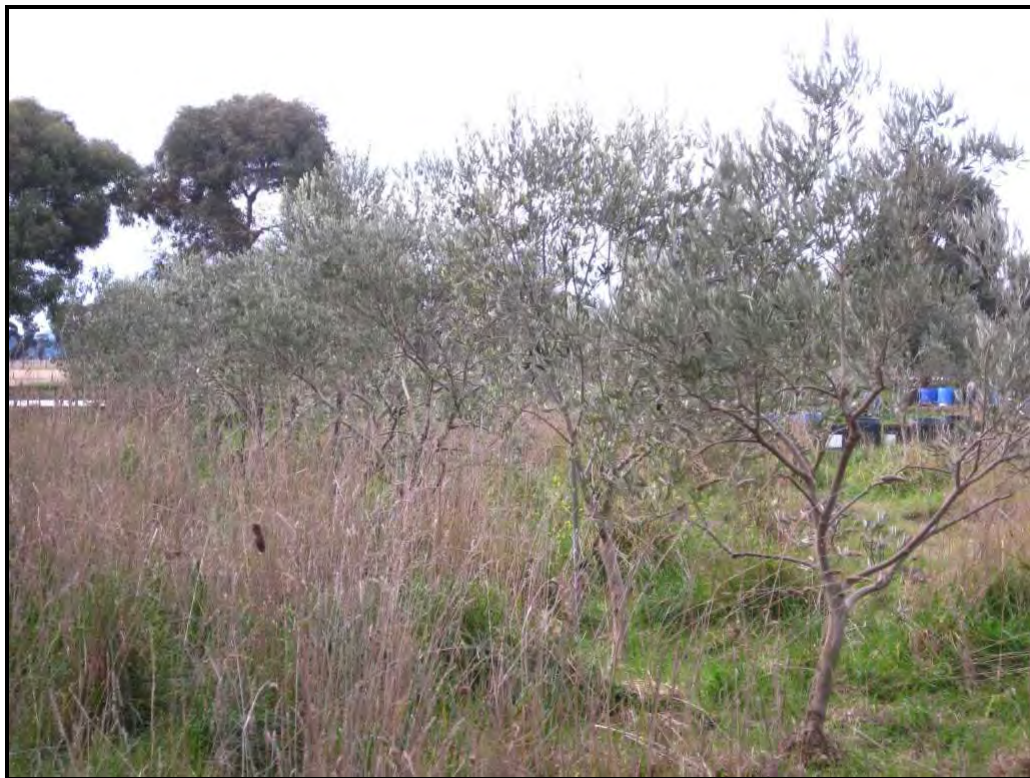
Photograph 8: View of olive trees and drums on 770 Summerhill Road (parcel 502093), facing northeast.