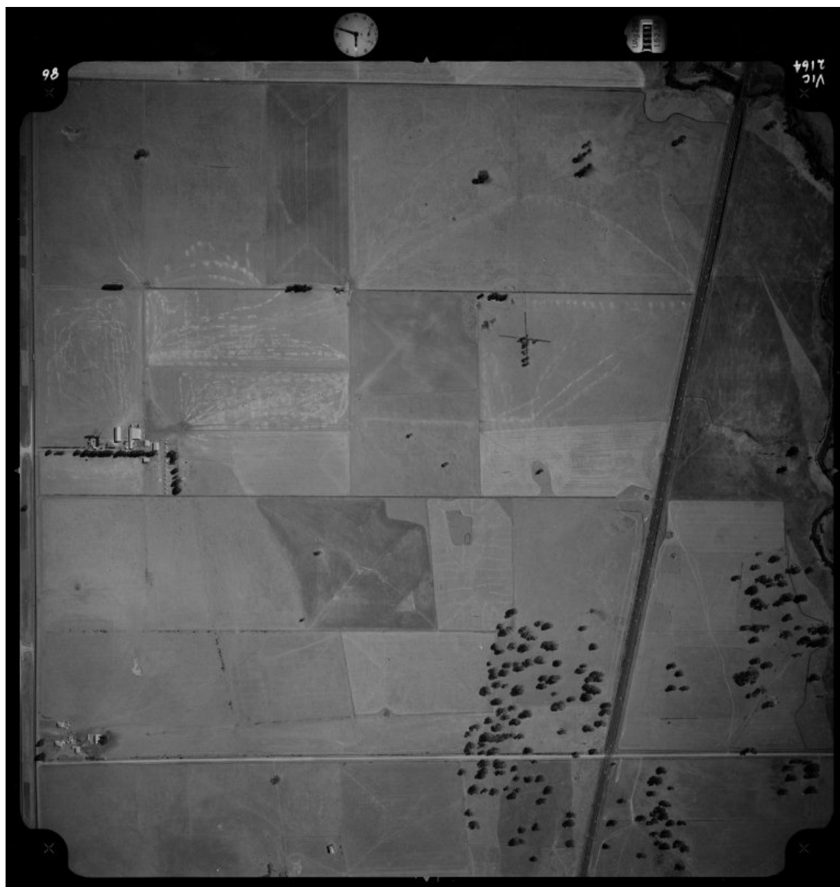
Aerial photograph dated October 1968, showing central portion of PSP Area 25.