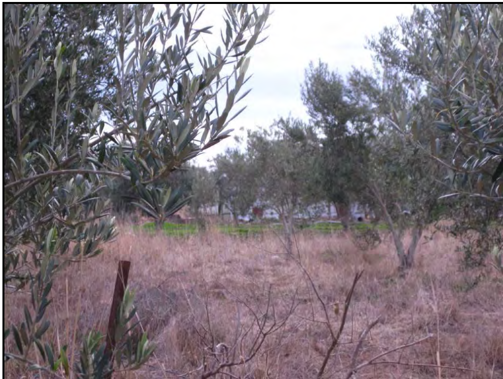
Photograph 6: View of olive grove at 185 Brookville Drive (parcel 501726), facing west from Brookville Drive.