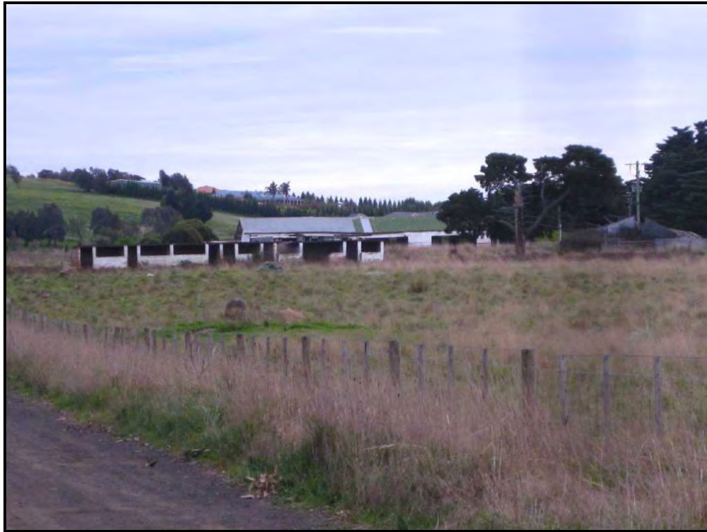
Photograph 3: View of abandoned building at 920A Summerhill Road (parcel 501955), facing west from unpaved track off Brookville Drive.