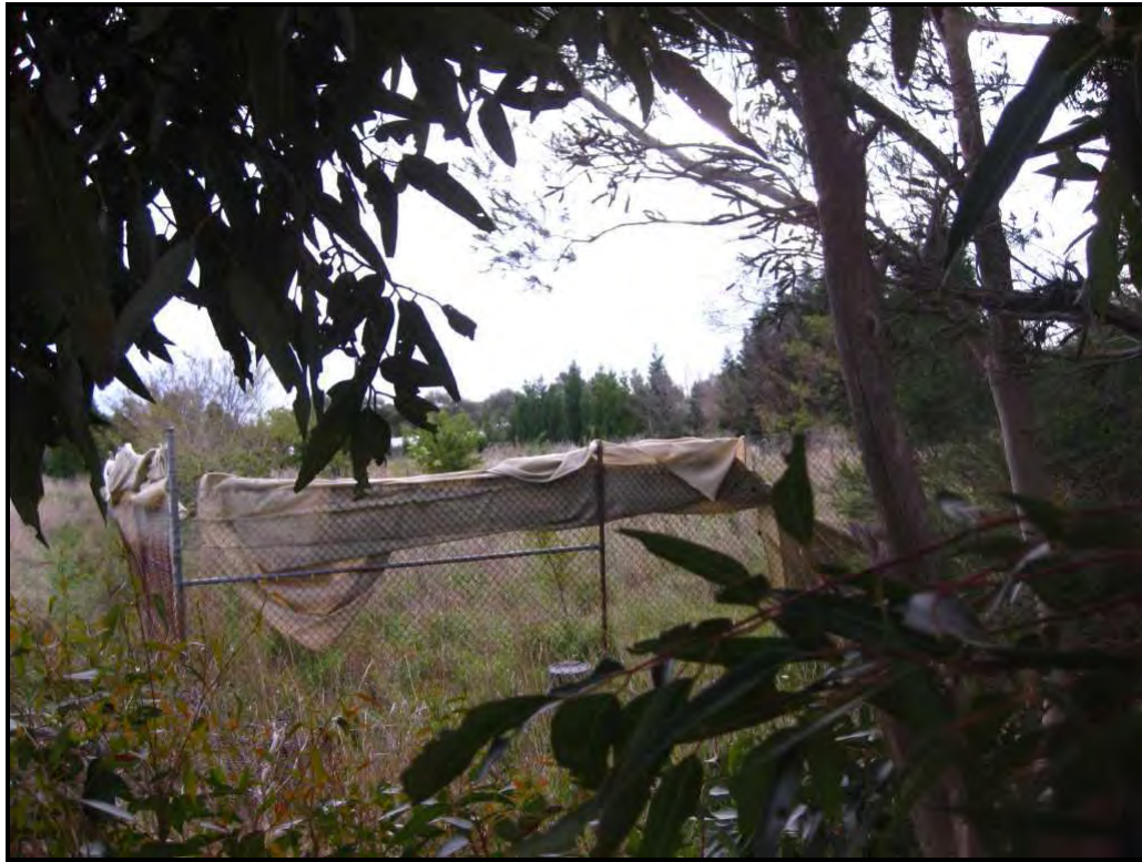
Photograph 7: View of fallow market garden field on 810 Summerhill Road (parcel 502095), facing northwest.