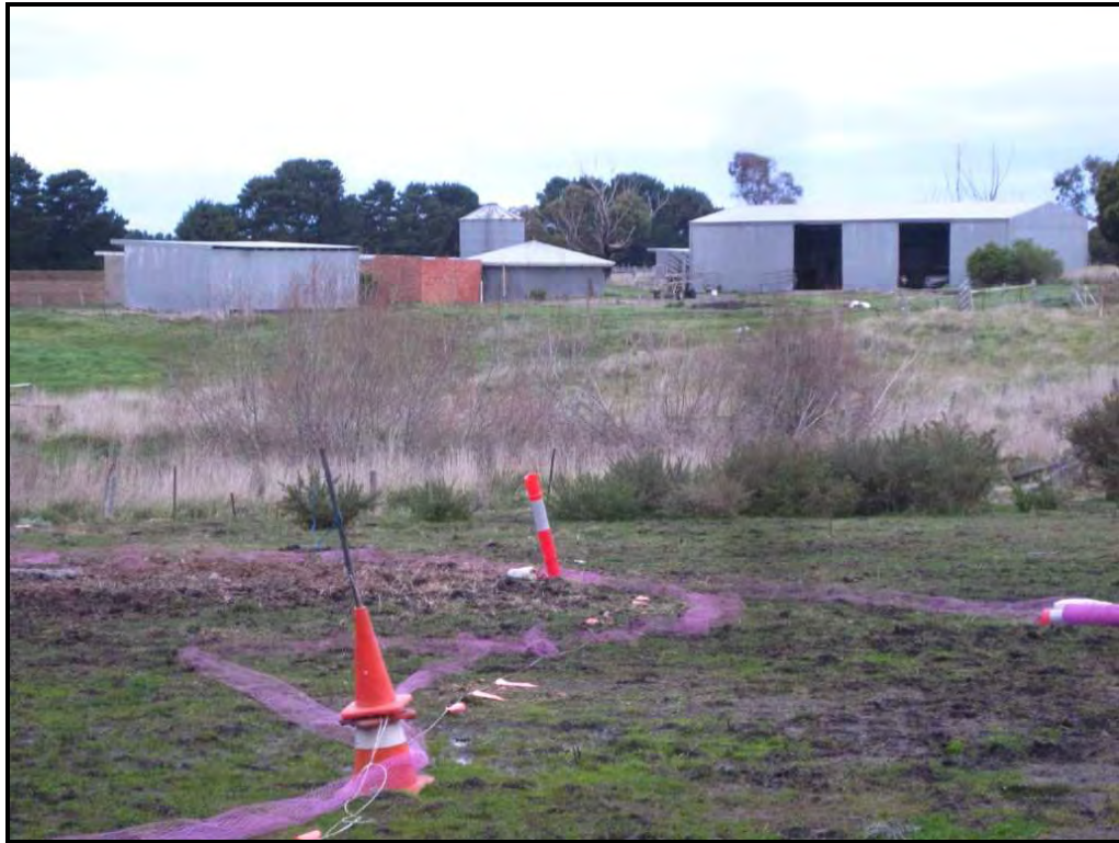
Photograph 5: View of buildings and silos at 750 Donnybrook Road (parcel 397661), facing southeast from Donnybrook Road.