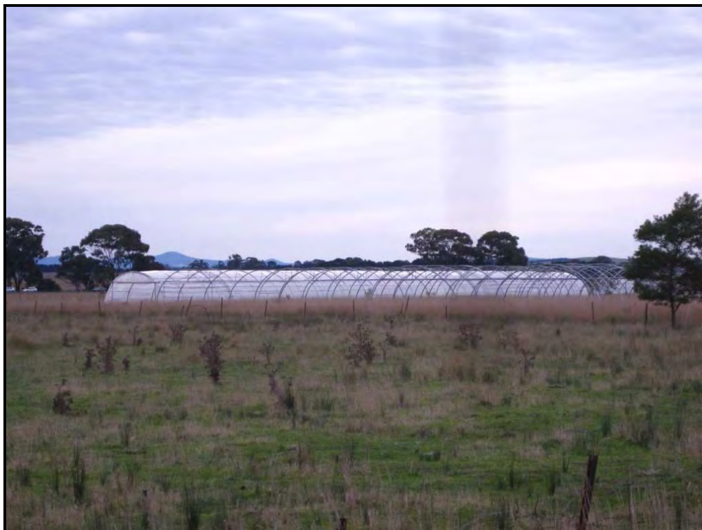
Photograph 4: View of market garden greenhouses at 185 Brookville Drive (parcel 501726), facing southwest from Brookville Drive.