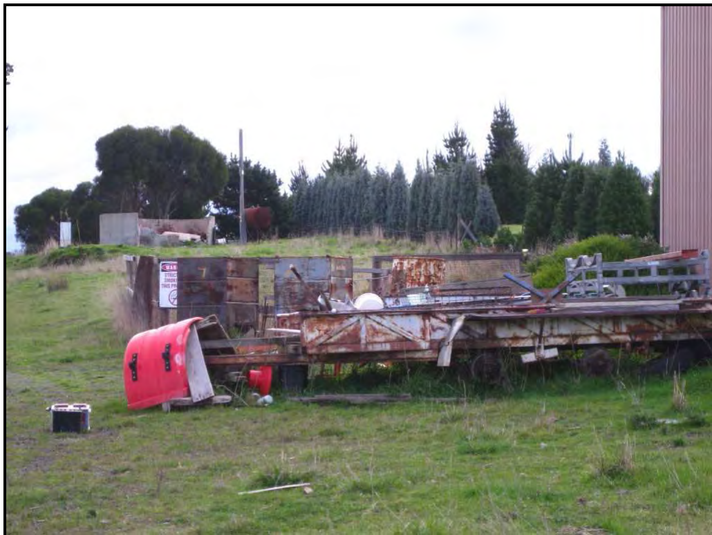
Photograph 10: View of storage bins, debris and an aboveground storage tank on 30 Amaroo Road (parcel 501722), facing northwest from Amaroo Road.