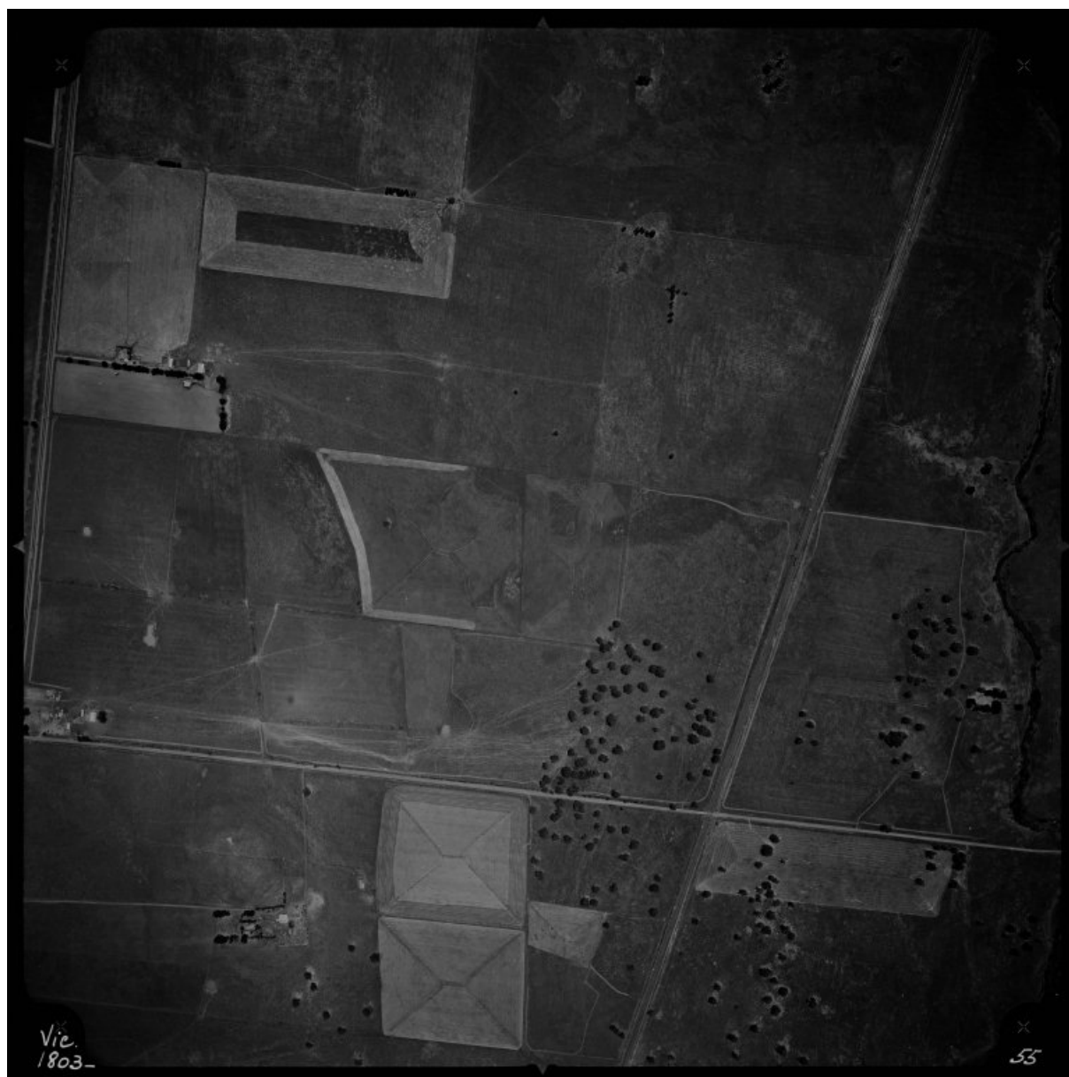
Aerial photograph dated April 1963, showing central portion of PSP Area 25.