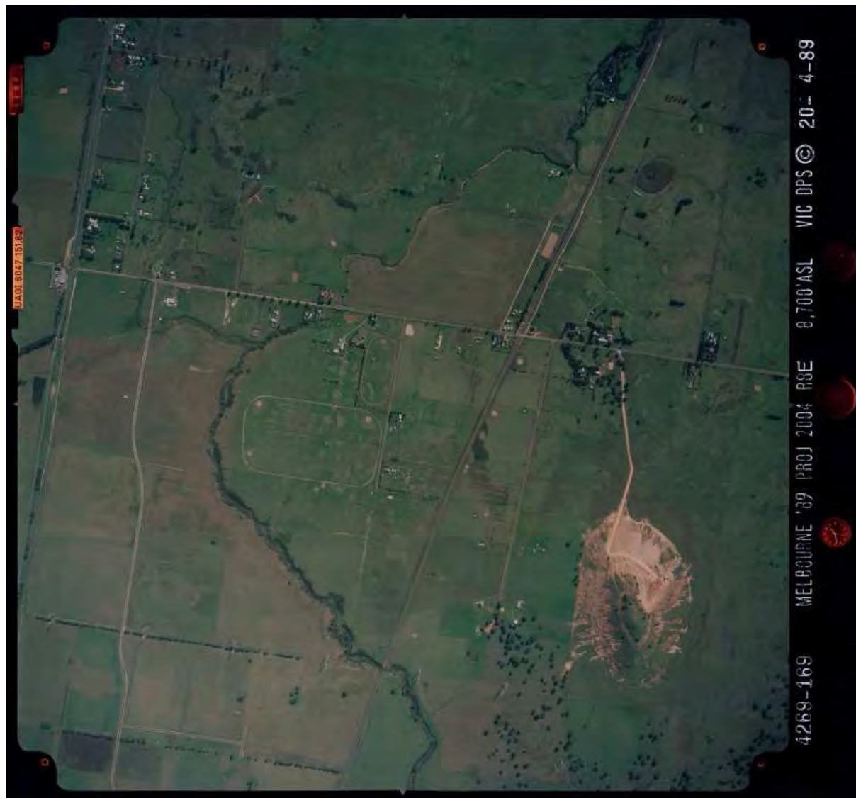
Aerial photograph dated 20 April 1989, showing northern portion of PSP Area 25.