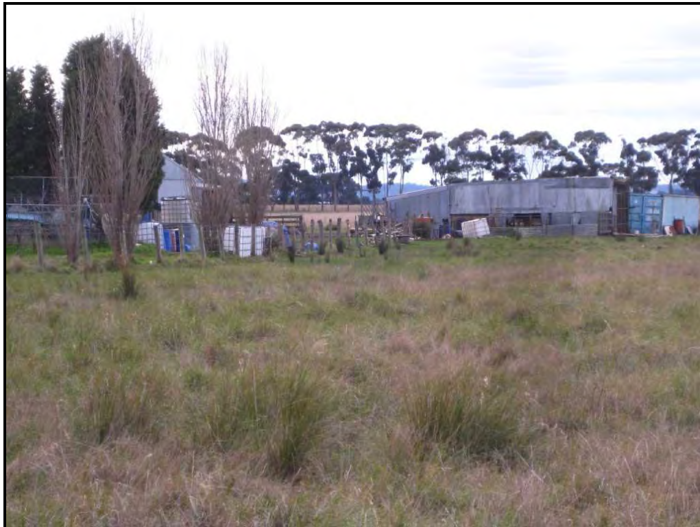
Photograph 1: View of buildings and plastic totes at 770 Summerhill Road (parcel 502093), facing east.