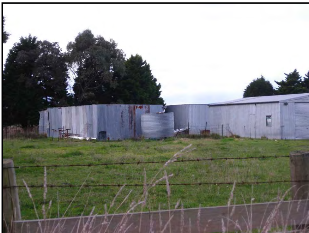
Photograph 2: View of buildings and silo at 860 Summerhill Road (parcel 502097), facing northeast from Summerhill Road.