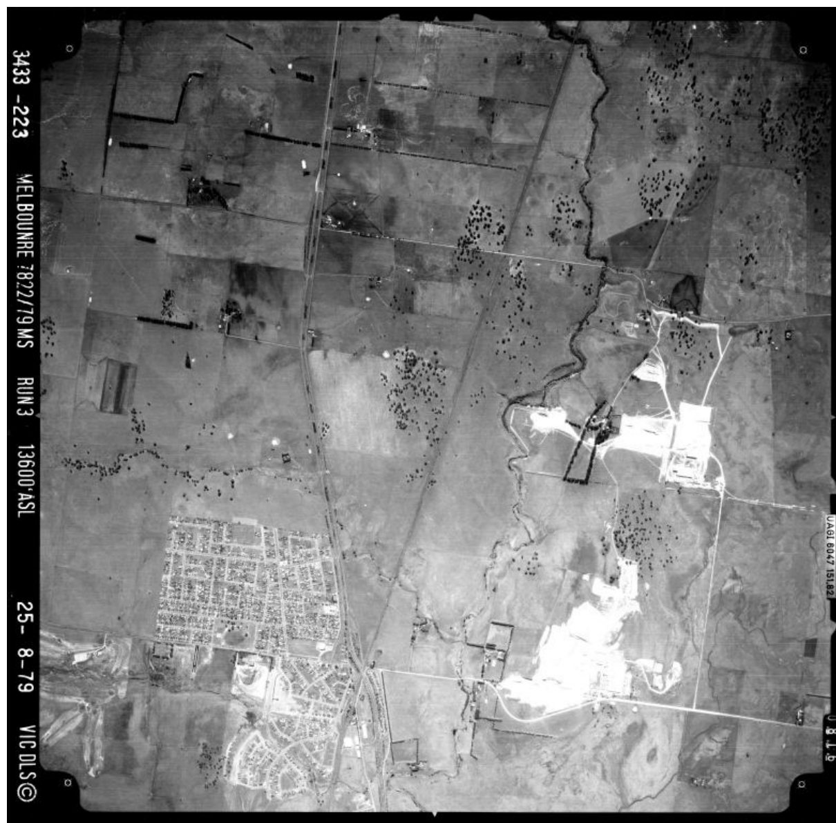
Aerial photograph dated 25 August 1979, showing southern portion of PSP Area 25.