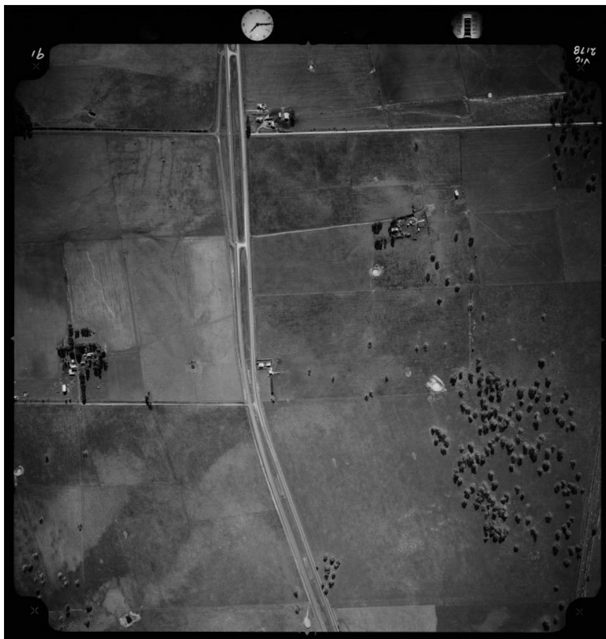
Aerial photograph dated October 1968, showing southern portion of PSP Area 25.