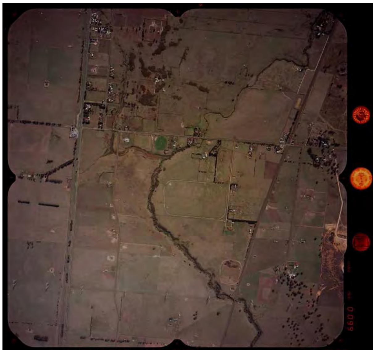
Aerial photograph dated 2 May 1998, showing northern portion of PSP Area 25.