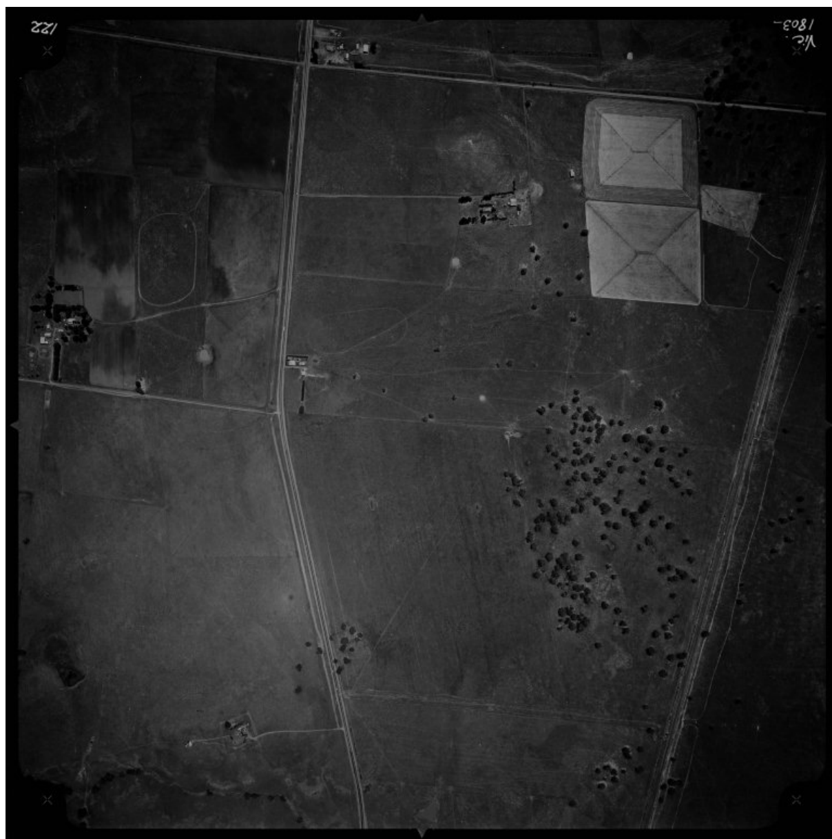
Aerial photograph dated April 1963, showing southern portion of PSP Area 25.