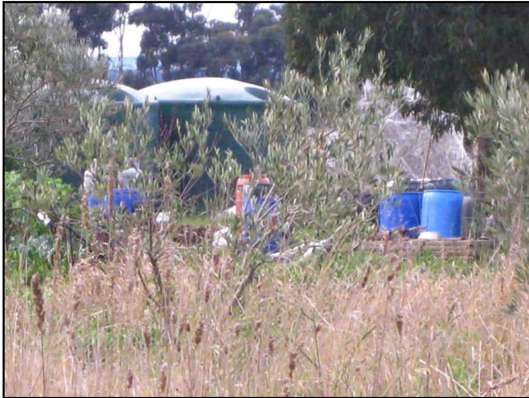
Photograph 9: View of aboveground tanks and drums on 770 Summerhill Road (parcel 502093), facing east.