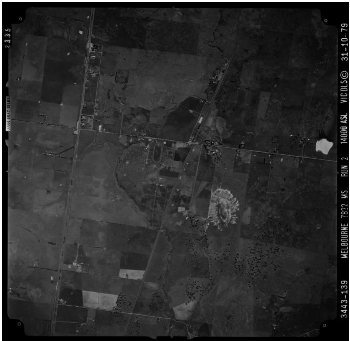
Aerial photograph dated 31 October 1979, showing northern portion of PSP Area 25.