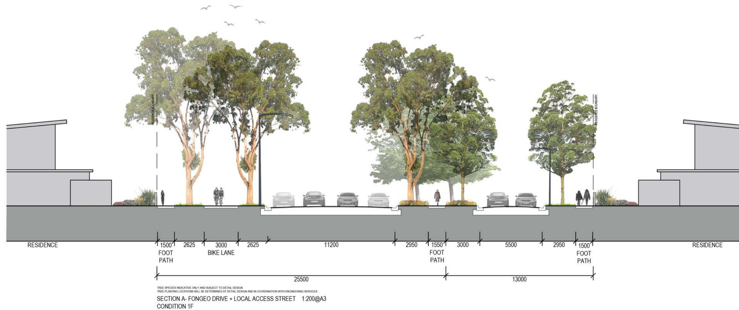
SECTION A - FONGEO DRIVE + LOCAL ACCESS STREET 1:200@A3 CONDITION 1F