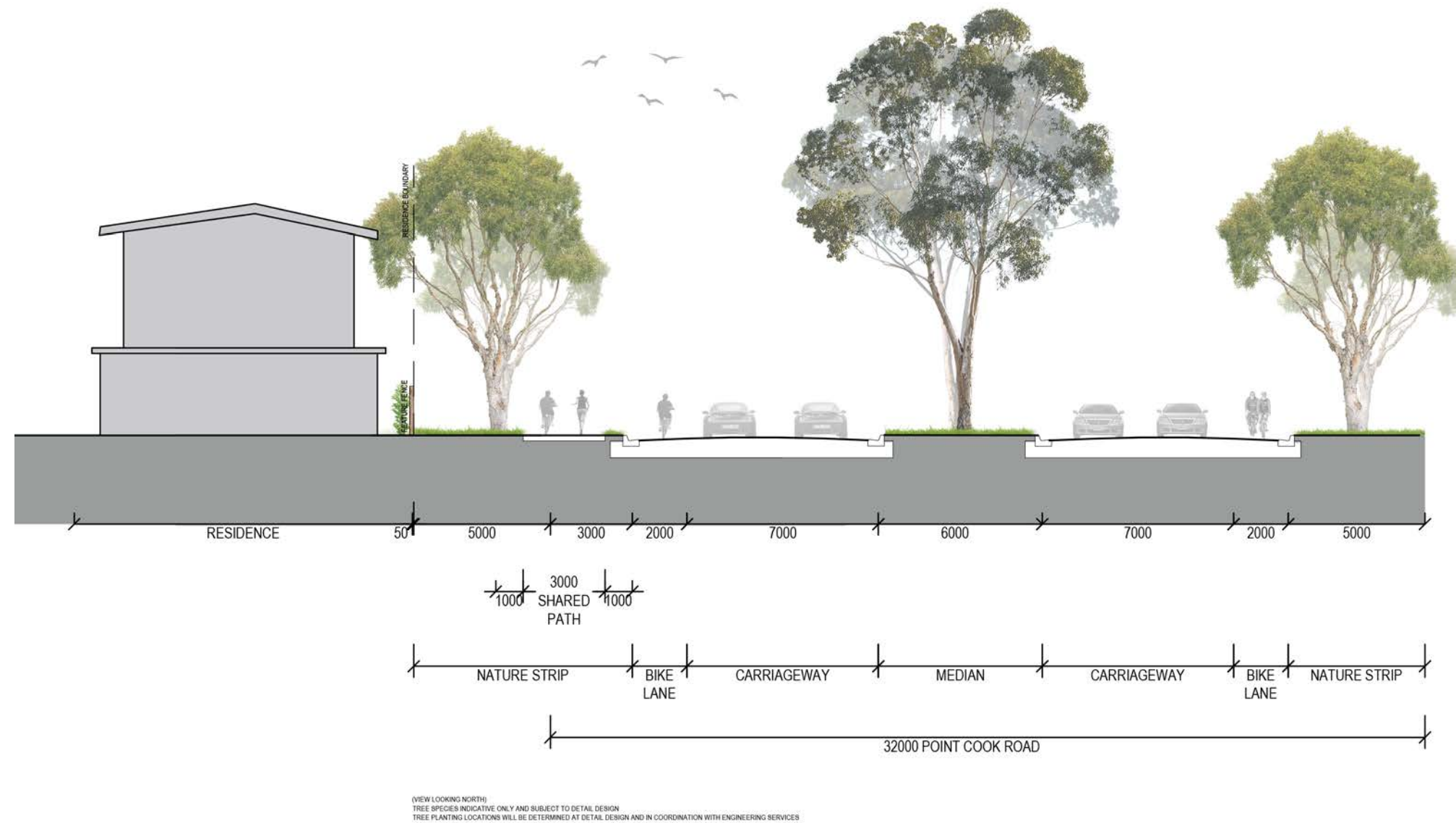
SECTION D- LOTS SIDING ONTO POINT COOK ROAD - 5M BUFFER TO POINT COOK ROAD CONDITION 1E 1:200@A3