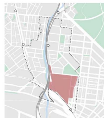
MELBOURNE METRO ARDEN STATION PRECINCT