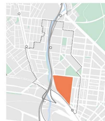
ARDEN CENTRAL AREA