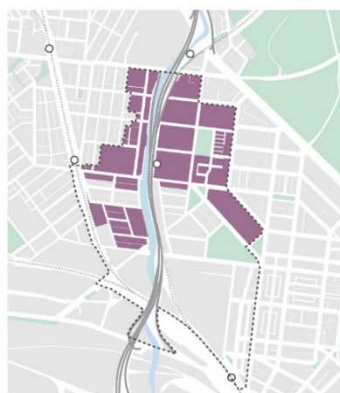
MACAULAY C190 AMENDMENT AREA