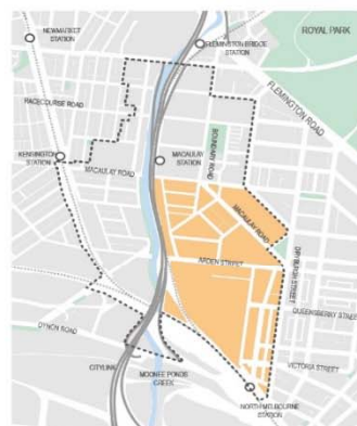
ARDEN URBAN RENEWAL PRECINCT