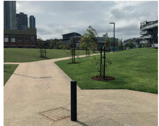
FIGURE 15: DAY 2 WORKSHOP PHOTO REFERENCES (ALSO DEPICTED THROUGHOUT THE RELEVANT SECTIONS OF THE DOCUMENT)