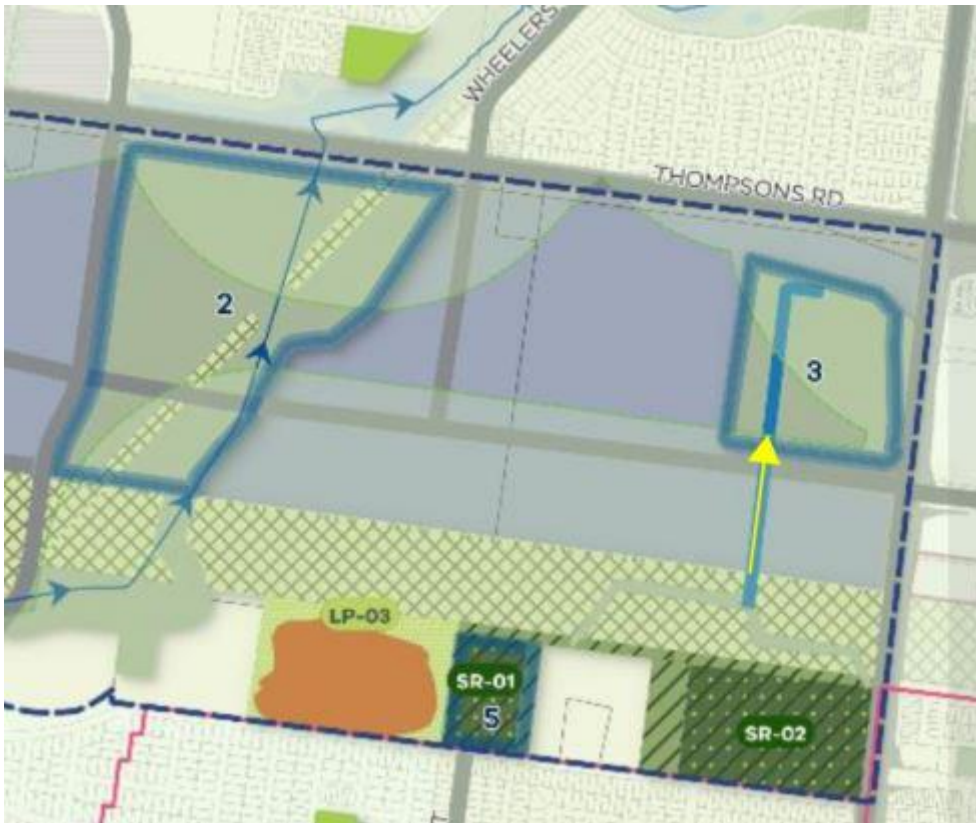
Image 3 – Major overland flow path (shown yellow) for Plan 7 - Public Realm and Water.