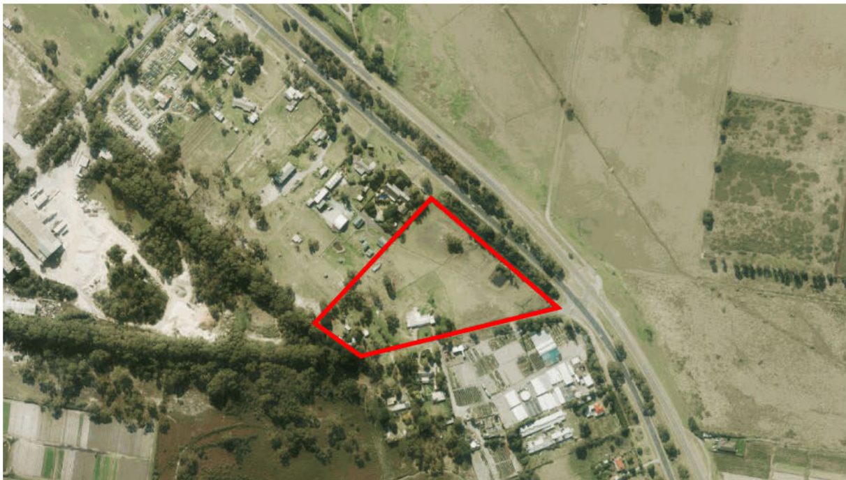
Figure 1 – Aerial of overall site (highlighted in red)

The overall site is improved by a single dwelling and associated outbuildings located towards the northwestern corner of the site. The site also benefits from Planning Permit PlnA01010/19 for use and development of the southeast corner of the site for the purposes of a service station.