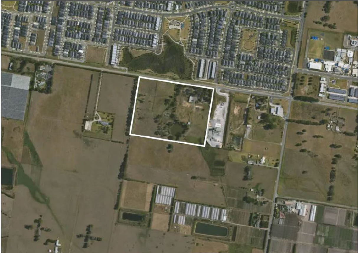
Figure 1 - Aerial view of subject site (bold white outline) and immediate surrounds

The land is located within the Urban Growth Zone (UGZ) and is partially affected by the Land Subject to Inundation Overlay (LSIO).