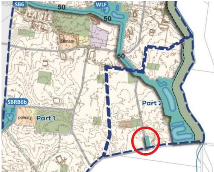
Figure 1 - Drainage asset as shown in Plan 9 of the PSP, previously agreed with VPA to be removed